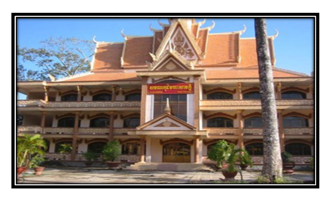
Khmer Theravāda Buddhist College at Trà Vinh