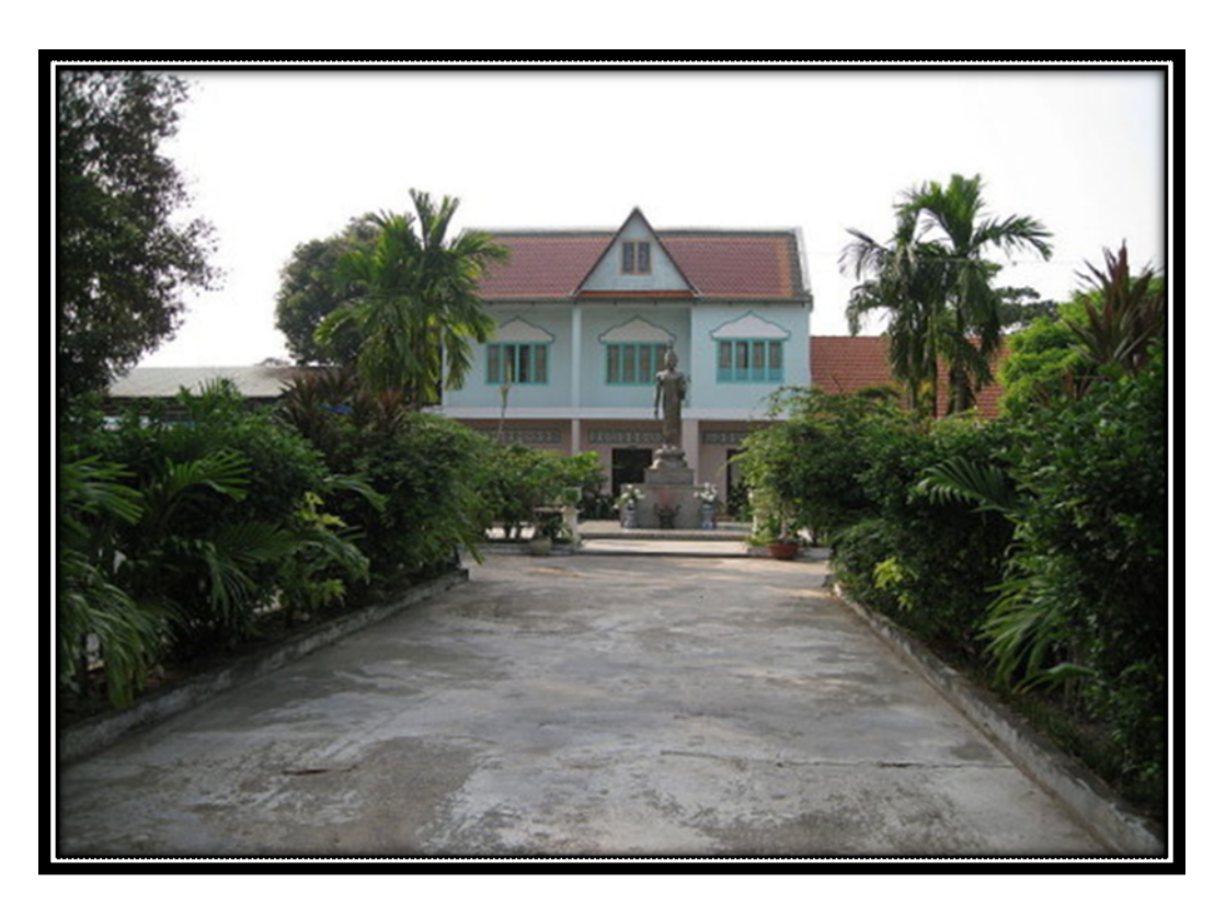
Nguyên Thuỷ Meditation Center in HCMC