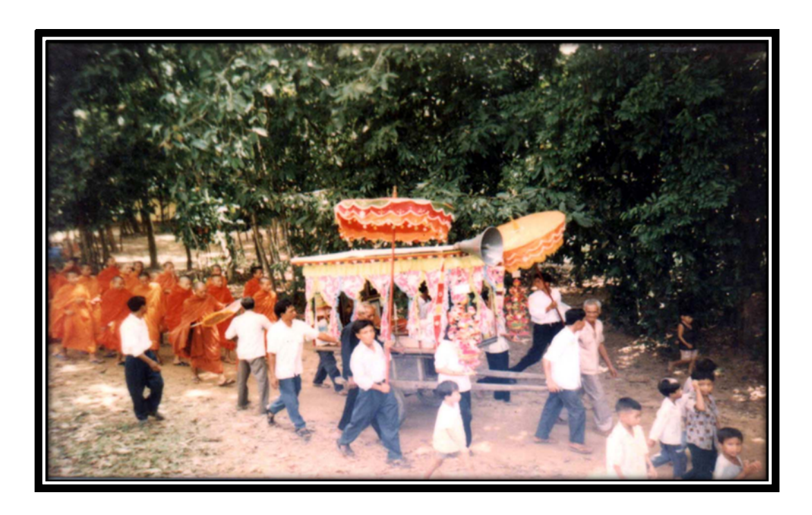
Choul Thnam Thmay Festival