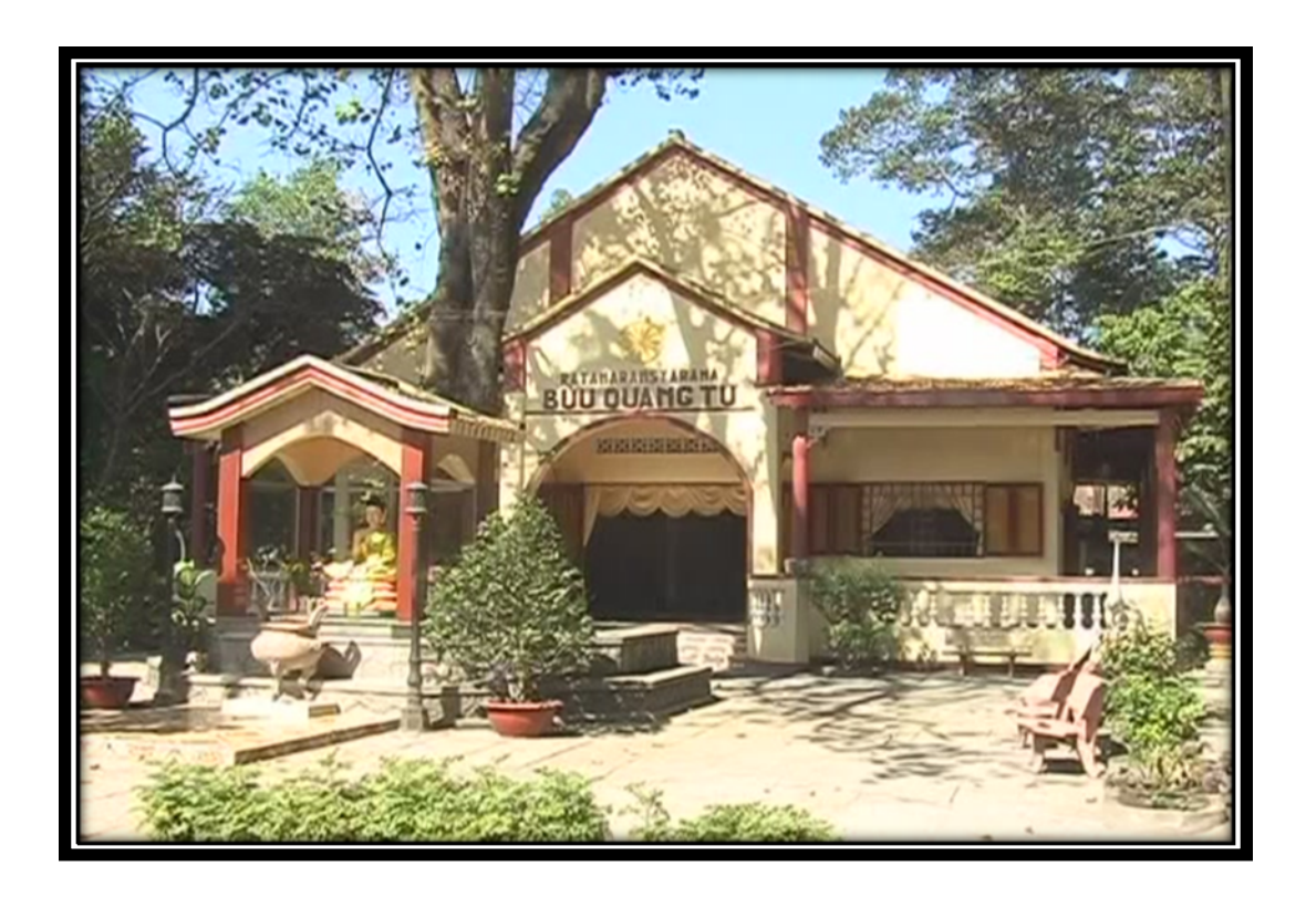
Bửu Quang Temple (The first Vietnamese Theravāda Temple)