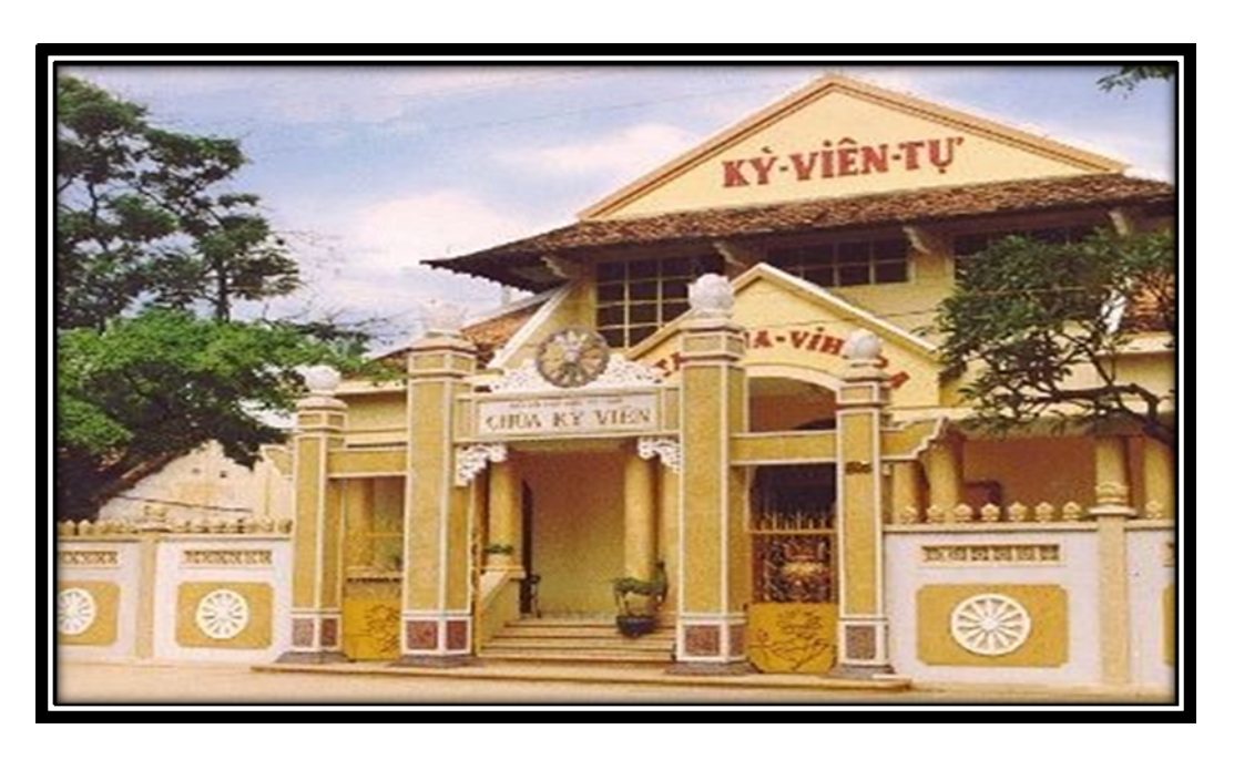
Chùa Kỳ Viên (Jetavana Vihāra) in HCMC (The Centre of Theravāda activities in Vietnam)