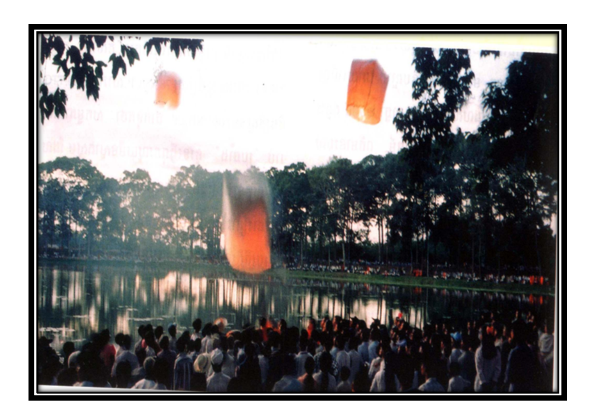
Ok- Om - Bok Festival